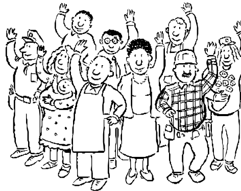
JUST SOME OF THE PEOPLE WHO FOUND WORK!